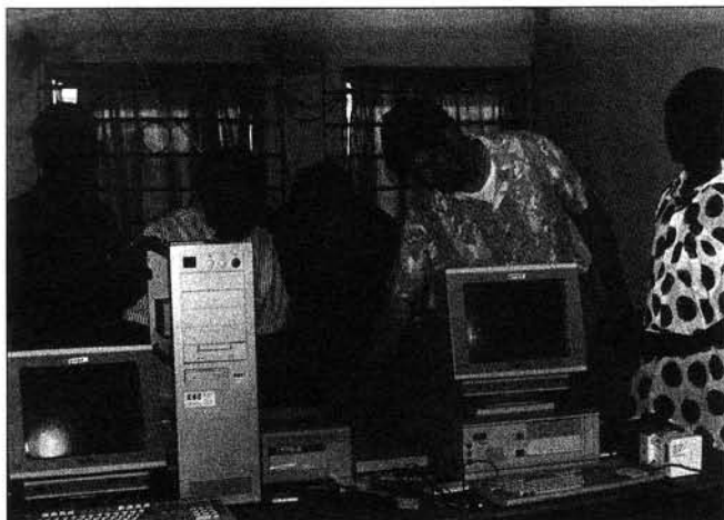
Figure 2. OAU Computer Room

Inside each building, an Ethernet 10-BASE 2 cabling structure is installed in order to keep the initial costs as low as possible (i.e., no hubs, less cable) and to ensure the local availability of spares (BNC), etc. In each of these buildings, a Linux PC acts as "faculty server" and provides mail services for the local users and does routing to the backbone. This strategy has been selected to keep the user-generated traffic local and reduce the access to the main backbone. All services are TCP/IP-based to keep the system as standard as possible with Internet protocols, avoiding future modifications when full connectivity might be provided to the university.