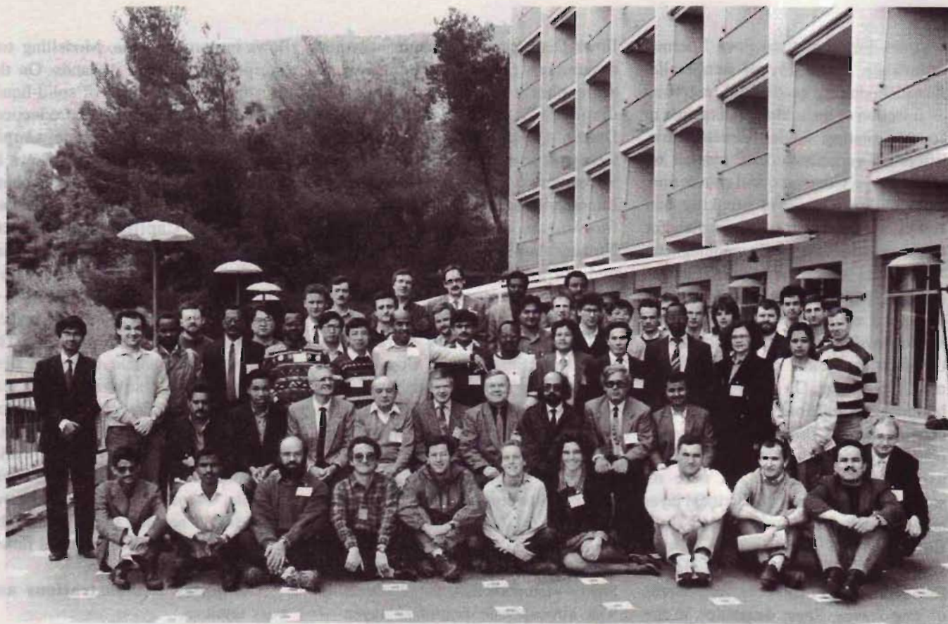
Workshop on science and technology of thin films, 7 – 25 March 1994.

lecturers and participants (42 from developing countries).