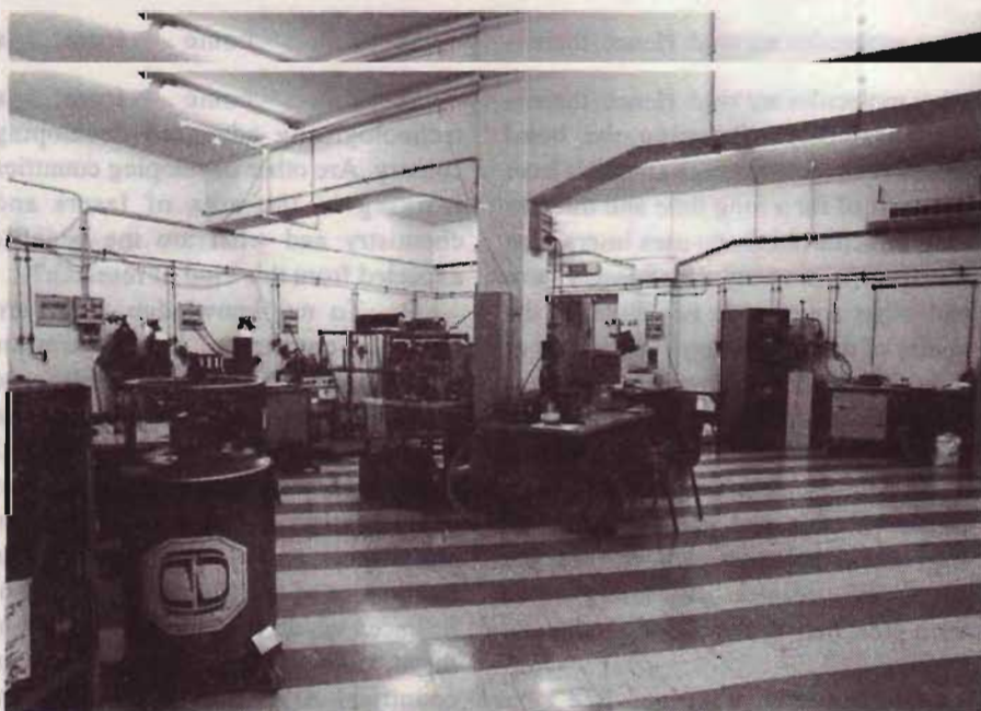
A view of the ICTP High Temperature Superconductivity Laboratory.