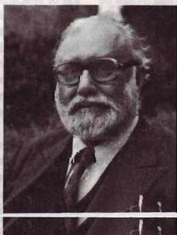
Abdus Salam, Founder of the ICTP and Director from 1964 to 1993.

Since 1 January 1994, Professor Abdus Salam is the President of the International Centre for Theoretical Physics of Trieste. This new function was created especially for him by the IAEA and UNESCO in view of his exceptional merits. The change was announced in a communication from Abdus Salam himself to the scientists and staff of the ICTP a few days before the 1993 Christmas vacation. Rumours in that sense had been circulating for some time, therefore the news was not quite unexpected. But still, though we realized that Professor Abdus Salam had directed the ICTP since its inception, we intimately hoped that he would have remained at the helm for several years. We know that we shall continue to benefit from his experience and