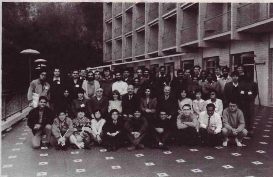
Second School on the use of synchrotron radiation in science and technology: "John Fuggle Memorial", 25 October - 19 November 1993.

Lectures: Machine. UV and X ray interaction with matter. Vacuum. Machine design. Synchrotron radiation. Insertion devices. Design goals: conservation of brilliance; ray tracing. Source characteristics. Introduction to ray tracings — a source and one mirror. Optimising the beamline to the needs of the experiment. Grating theory: spherical (toroidal) and plane gratings. Reality: tangent errors and thermal loads. Mirror systems. Fresnel based optics and microlab. A complete beamline. Crystal monochromators. Several beamline designs. X-ray detectors. SR applications to biology. Surfaces. The scientific programmes of ELETTRA. XAS absorption spectroscopy: introduction. X-ray absorption fine structure. XAS practical examples. XAS instrumentation for X-ray spectrometry. XAS polarisation and XAFS. XAS dichroism. Diffraction applied to materials science: introduction. XAS X-ray spectrometry. Anomalous X-ray scattering. SAXS. XAS oxygen K-edges. Dynamical diffraction: introduction. Standing wave and x/2 diffraction. XAS multiplet effects. Atomic and molecular spectroscopy. The National Laboratory for Synchrotron Radiation in Campinas, Brazil. Inorganic single-crystal crystallography. XAS X-ray MCD.