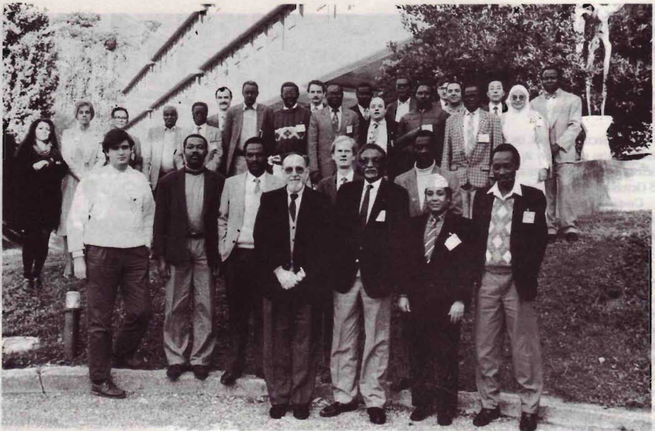
Seminar on radiowave propagation in tropical regions, 29 November - 3 December 1993.

activities on propagation. Importance of radiowave propagation data in the work of ITU. Radiowave propagation data from tropical regions: brief review. Multipath propagation and fade statistics in Sudan. Characterization of multipath fading phenomena in Egypt. Slant path rain attenuation measurements in Africa. Rainfall rate cumulative distribution modelling for determination of rain attenuation statistics on terrestrial and satellite radio links in tropical areas and everywhere else. The INTELSAT Ku-band radiometric measurements in Tropical Africa: propagation measurement equipment. Microwave attenuation in dust storms: theory and measurements. Statistical characterization of multipath fading in Egypt. Line of sight microwave propagation characteristics at 6GHz band in Ghana. Rain intensity and raindrop size measurements in Nigeria. The INTELSAT Ku-band radiometric measurements in Tropical Africa: data acquisition and quality control. Propagation measurements techniques: demonstration by ICTP. First time concurrent Ku-band beacon and radiometer measurements in the Tropics. Rain characteristics in a tropical locality