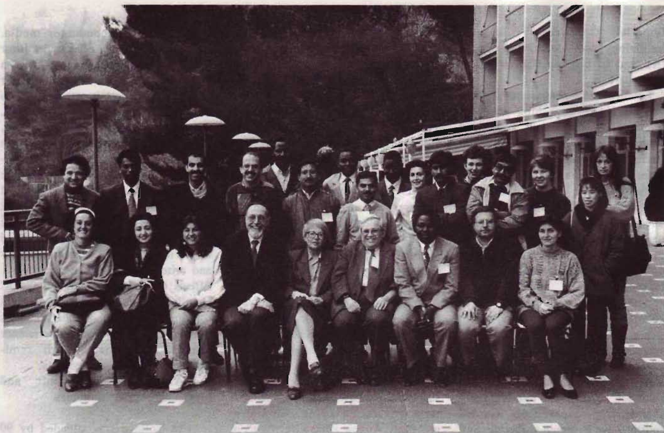
Workshop on study of atmospheric interactions by remote sensing, 21 February - 4 March 1994.