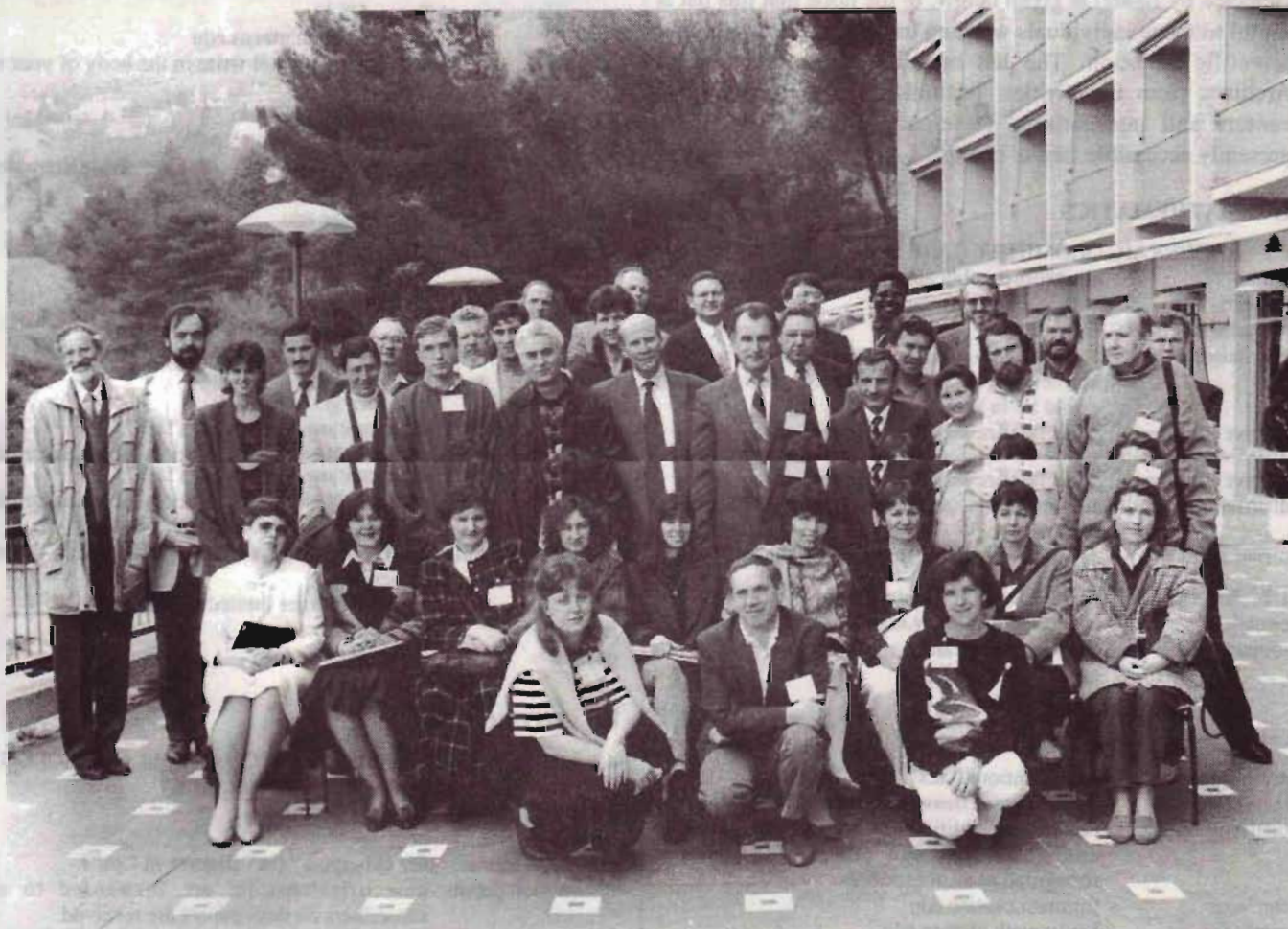
Training Course on dosimetry and dose reduction techniques in diagnostic radiology, 16 – 25 March 1994.

The Course was attended by 58 lecturers and participants (31 from developing countries). ♦