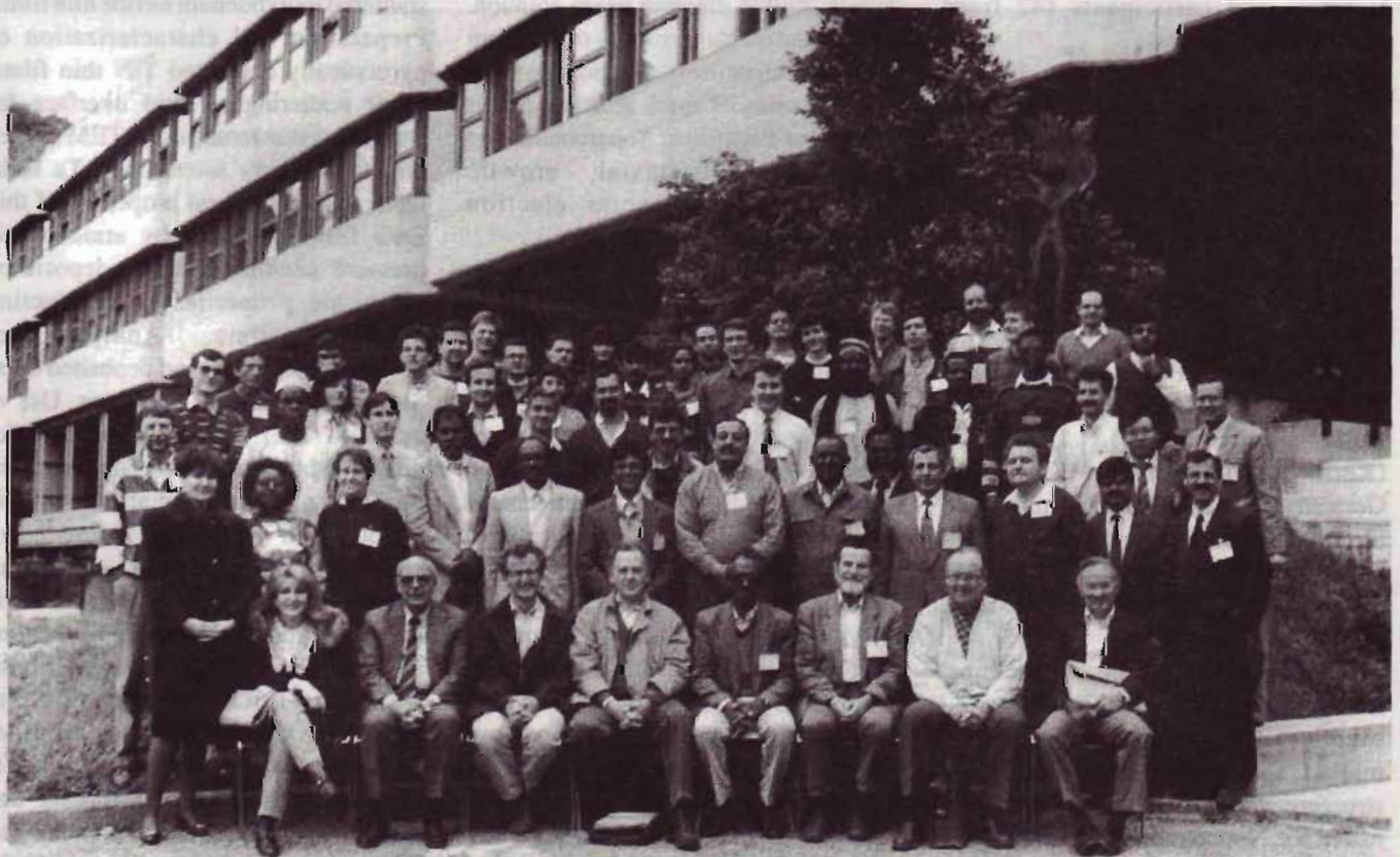
Workshop on fluid mechanics, 7 - 25 March 1994.