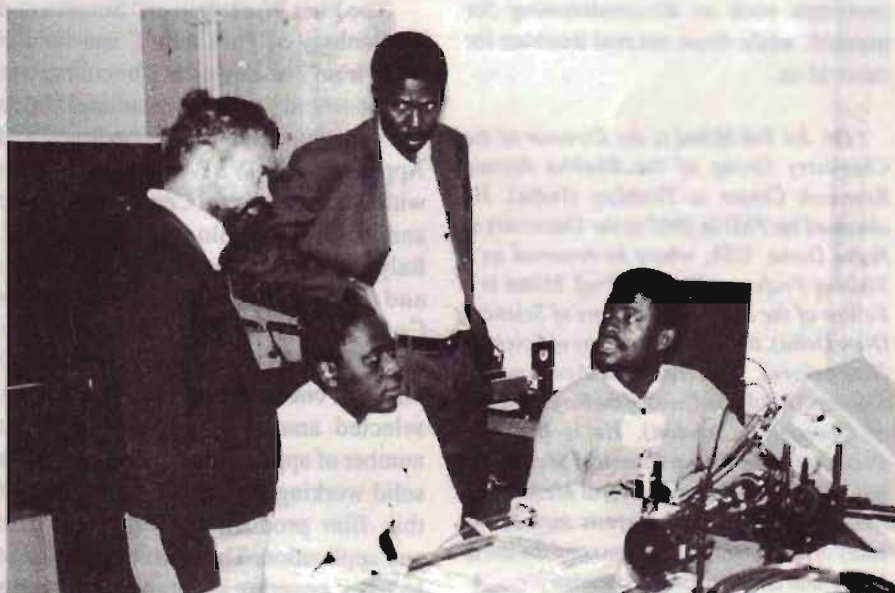
African physicists discussing an experimental set-up in the Laboratory for Lasers and Optical Fibres.