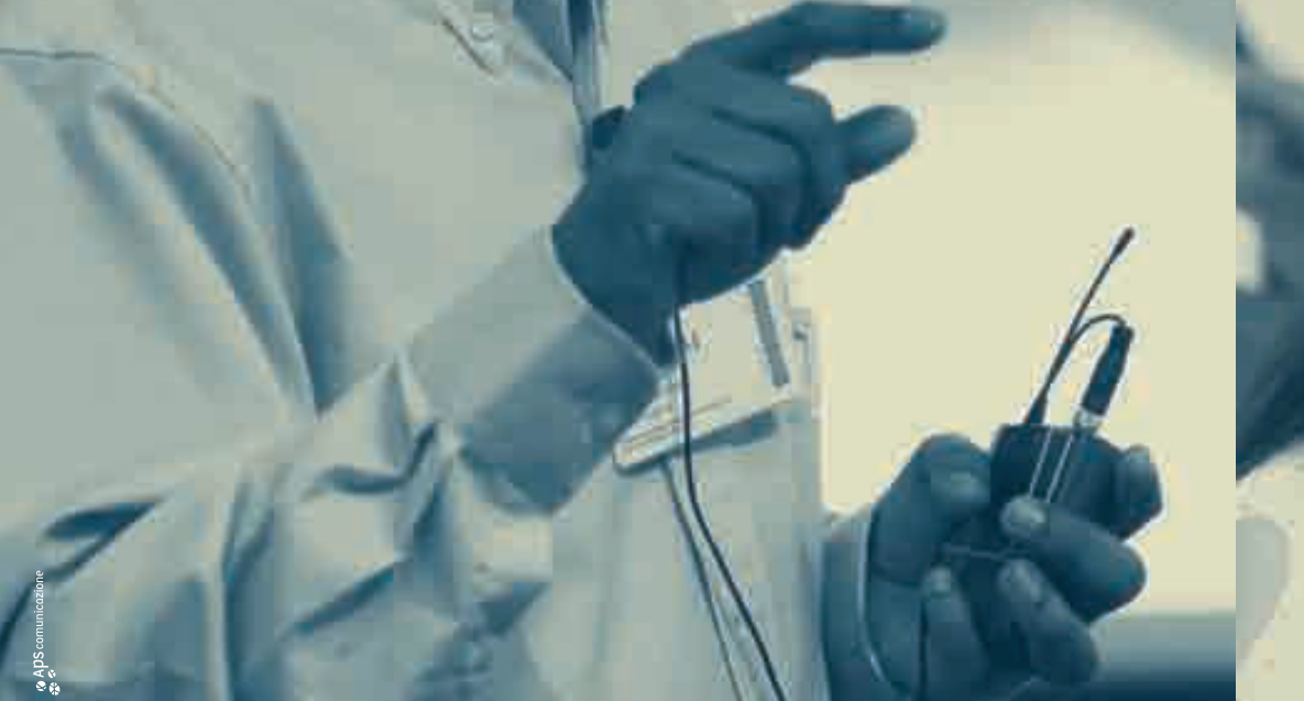
The Abdus Salam International Centre for Theoretical Physics