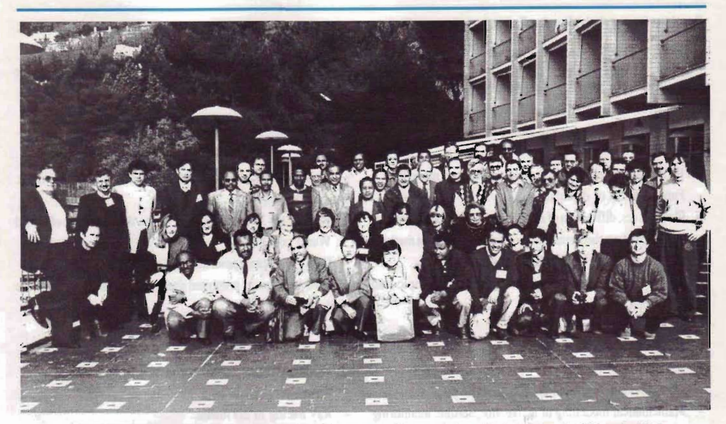
Second Workshop on three-dimensional modelling of seismic waves generation, propagation and their inversion, 7 - 18 November 1994.