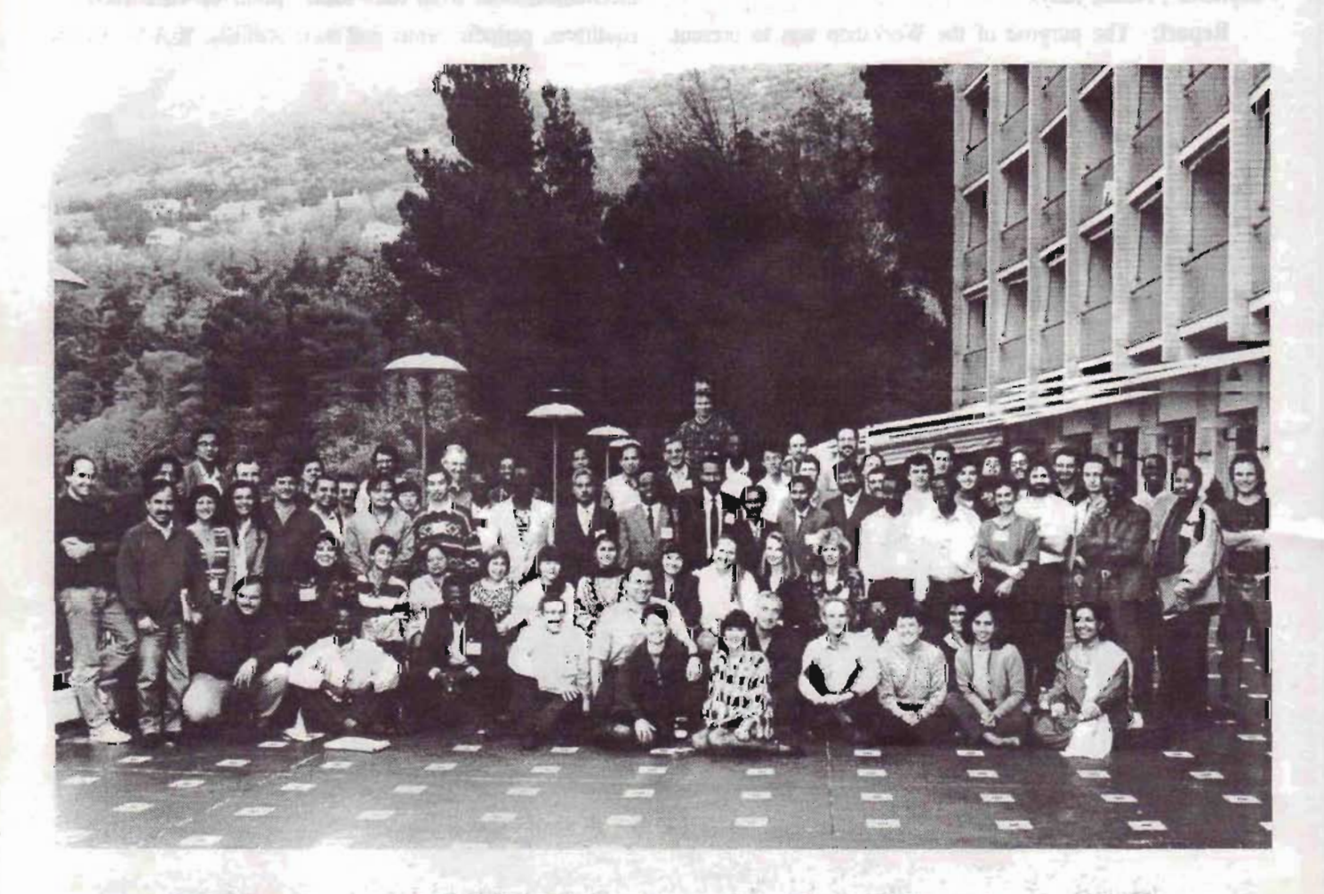
Fourth Autumn Course on mathematical ecology, 24 October - 11 November 1994.

Beside the lessons on the fundamentals of mathematics, numerous seminars were delivered and research groups on problems in the Third World were formed and constantly supervised by the lecturers. Special emphasis was given to discussions and personal contacts.