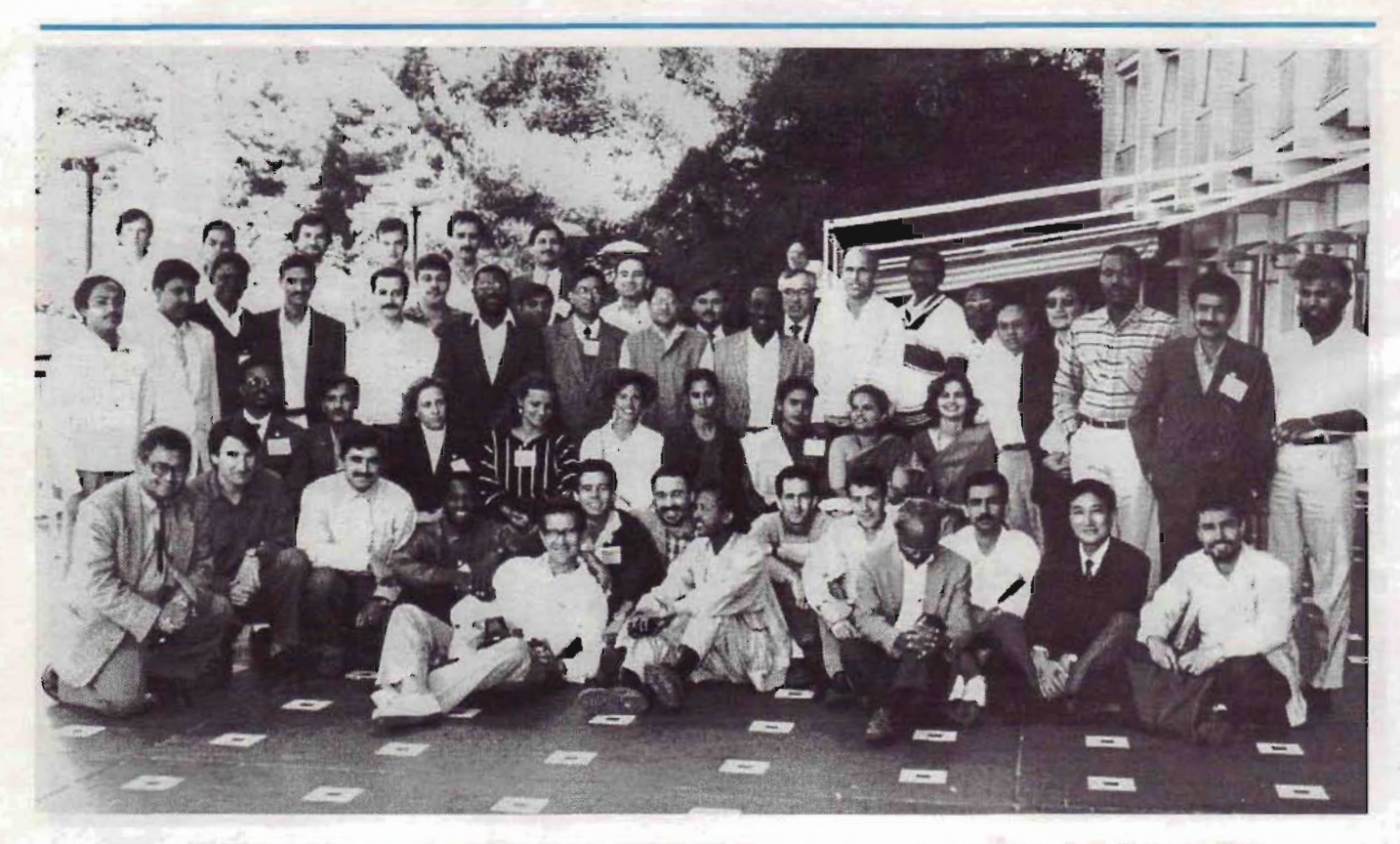
Third College on microprocessor-based real-time control - Principles and applications in physics, 26 September - 21 October 1994.

a circuit board external to the PC in the third week and work on half a dozen projects during the last.