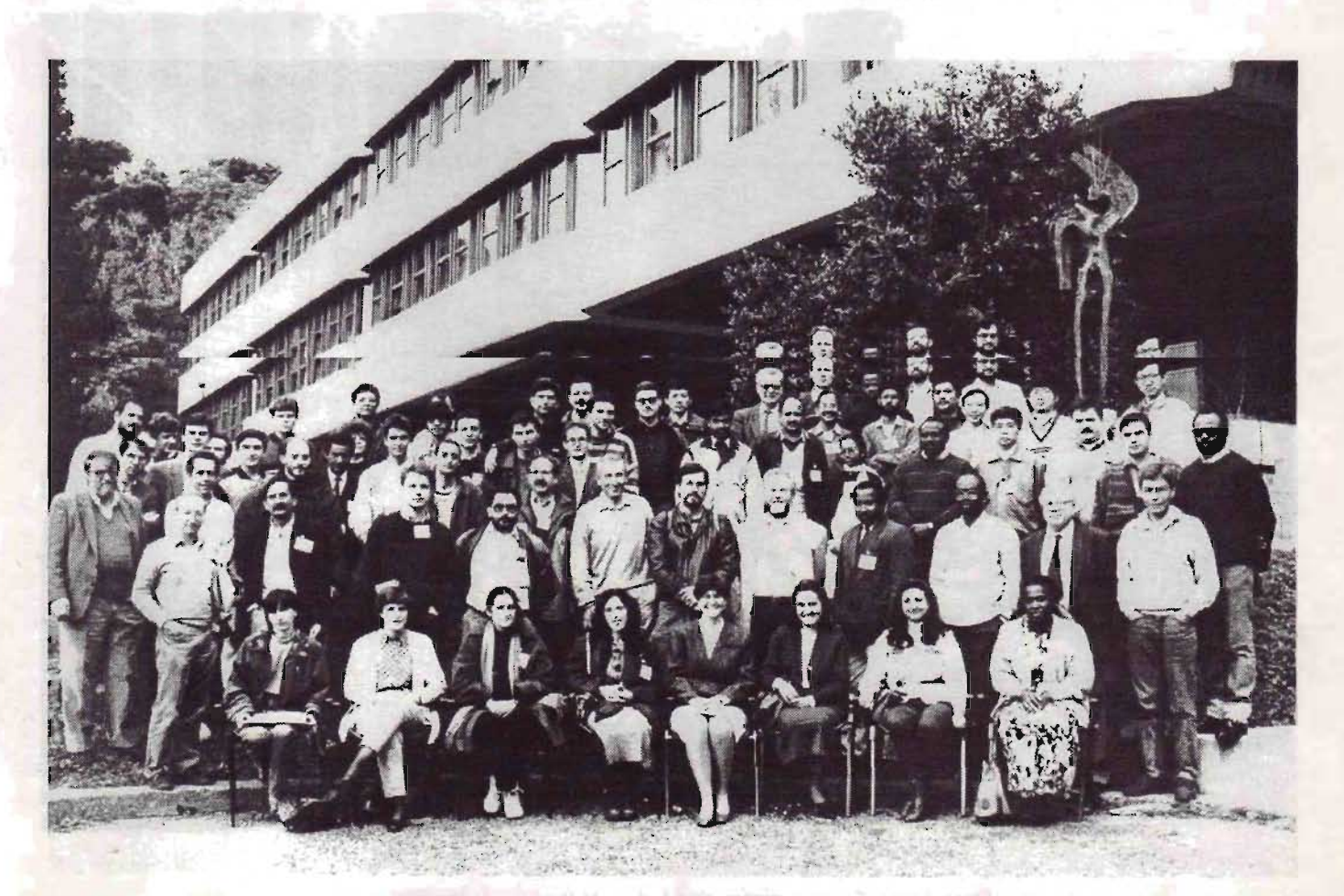
Workshop on variational and local methods in the study of Hamiltonian systems (Euroconference), 10 - 28 October 1994.

The Workshop was a successful attempt to bring together leading experts in those aspects of Hamiltonian mechanics which are more directly related to the N-body problem in celestial mechanics, both from the "local" point of view (relative equilibria, periodic orbits and their stability, K.A.M. theory